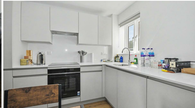
A stunning and modern furnished two bedroom first floor apartment, located within a few minutes walk of the town centre.